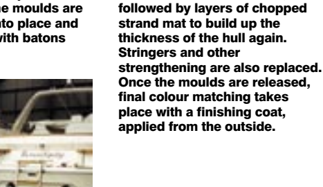
edges tapered, the moulds are carefully eased into place and