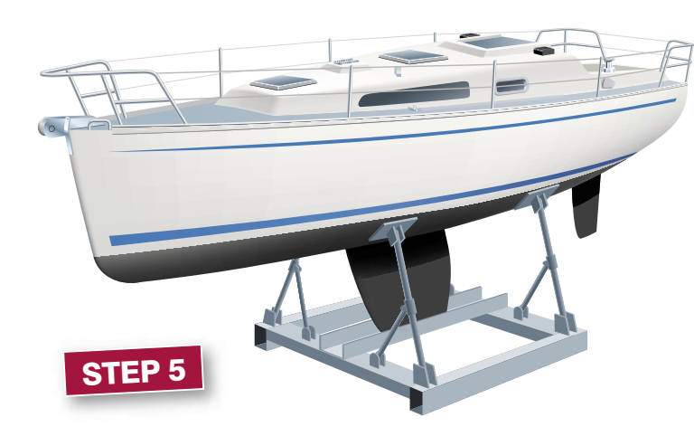
Colour match gel coat and replace interior fittings

■ For a full step-by-step guide to making moulds, see PBO 489