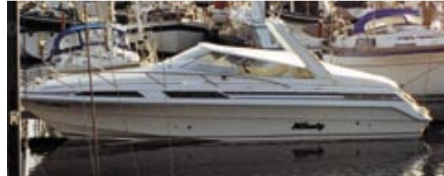
6 The finished item, as good as new with the repair completely invisible thanks to good colour matching and use of original specification fixtures, fendering and transfers.