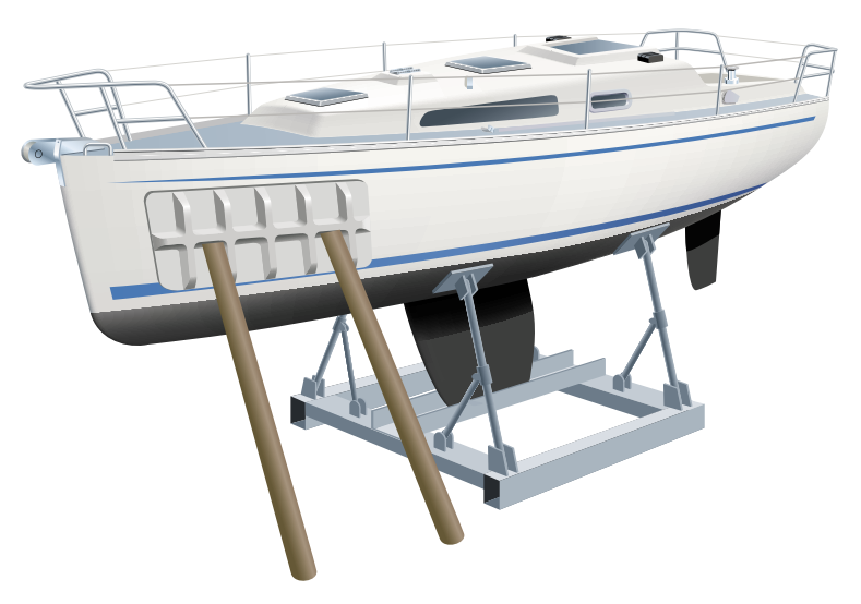
Take a mould from the 'made good area'. Then chop out the damage and rebuild from the mould as in steps 4 and 5 (above)