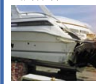
The worst of the damage was to the port quarter. where the transom had been completely opened up.

'With a new boat, it is often possible to ask the builders if they can send you a section of mould,' Mark Goodacre explained. 'This can sometimes take a while, as the mould will be in use all the time making new boats, but you might be able to find a gap in production where the builder will mould just the section you want. From that, you can then make a female mould – which is exactly what we did here.