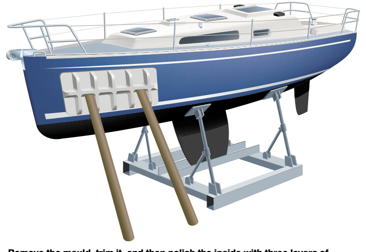
Remove the mould, trim it, and then polish the inside with three layers of release wax ready to fit against the hull of your own boat.