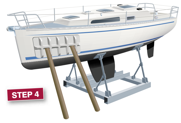
Put the mould in place and lay up from inside