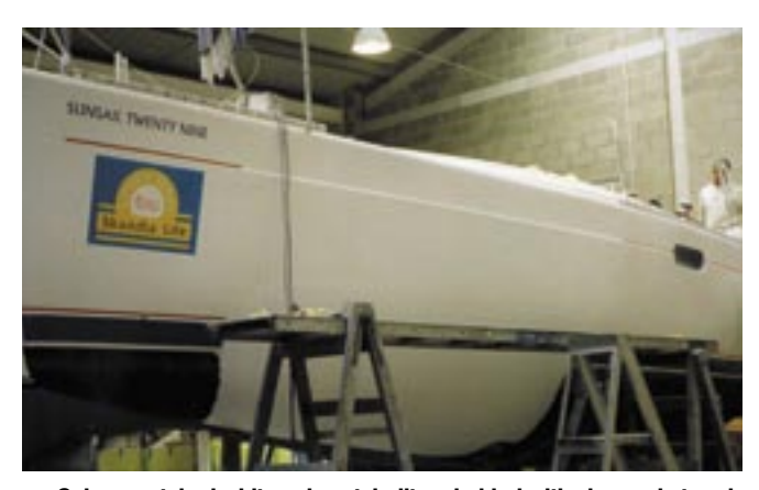
4 Colour-matched white gel coat, built up behind with chopped strand mat, has been used on the repair. Once the mould has been removed, additional layers of colour-matched gel coat will be applied from the outside. These will be repeatedly applied and sanded back until the whole hull is fair.