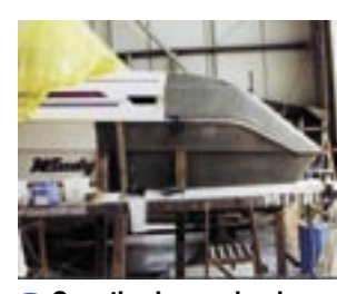
3 Once the damage has been cut back beyond the stress cracking, and the exposed then firmly held with batons