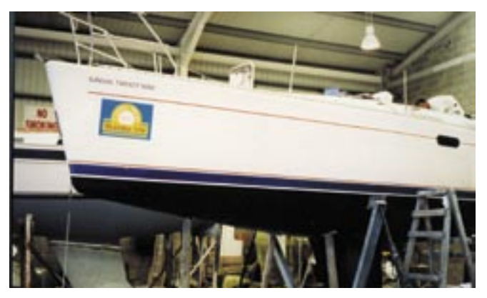
5 The finished job, complete with a fresh coat of antifouling, originalspec decals and a new toerail. From start to finish this job took about a month and cost £15,000.

With the insides of the cut-marks tapered, sheets of Melamine hardboard are now used to recreate the hull shape. This is fairly quick, but will it be quite labour-intensive when it comes to flatting back the gel coat that has been laid up against it from the inside.